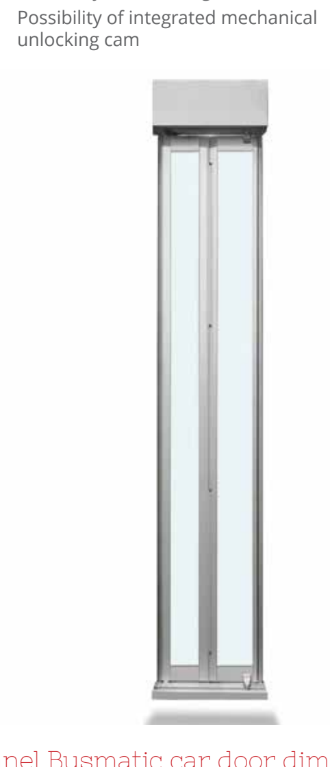
2 glazed panel Busmatic car door dimensions