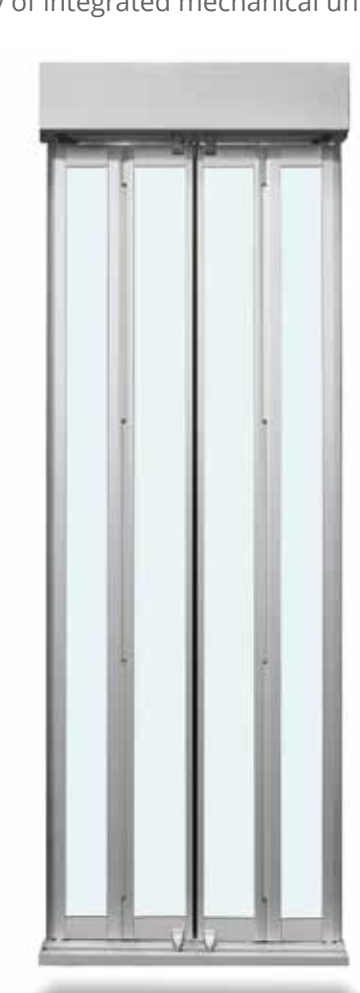
4 glazed panel Busmatic car door dimensions